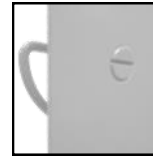
Standard Cam Latch